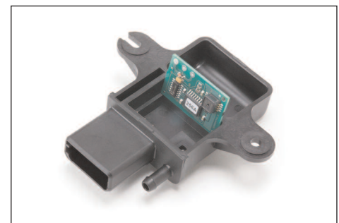
Figure 2 A non-potted, partially assembled Wells MAP sensor, with board tilted up to reveal ICs.